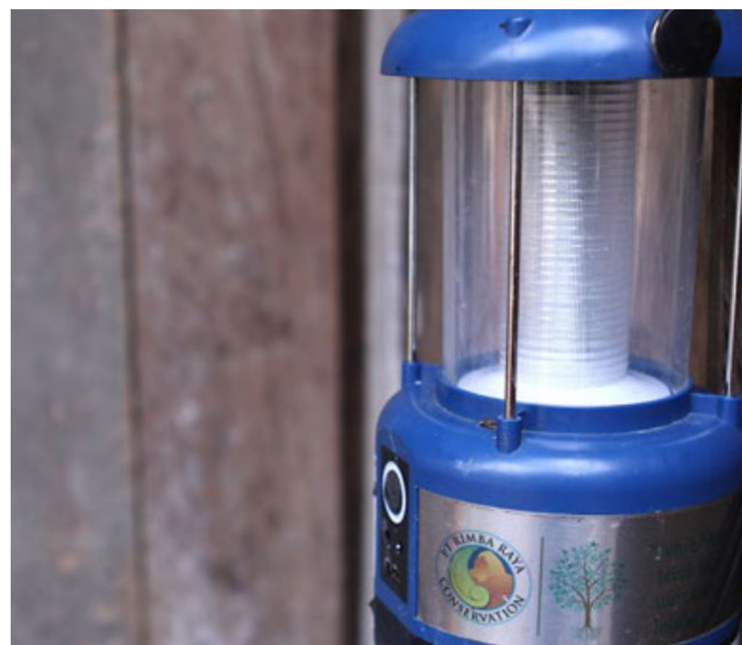
Every household has been given individual solar lamps