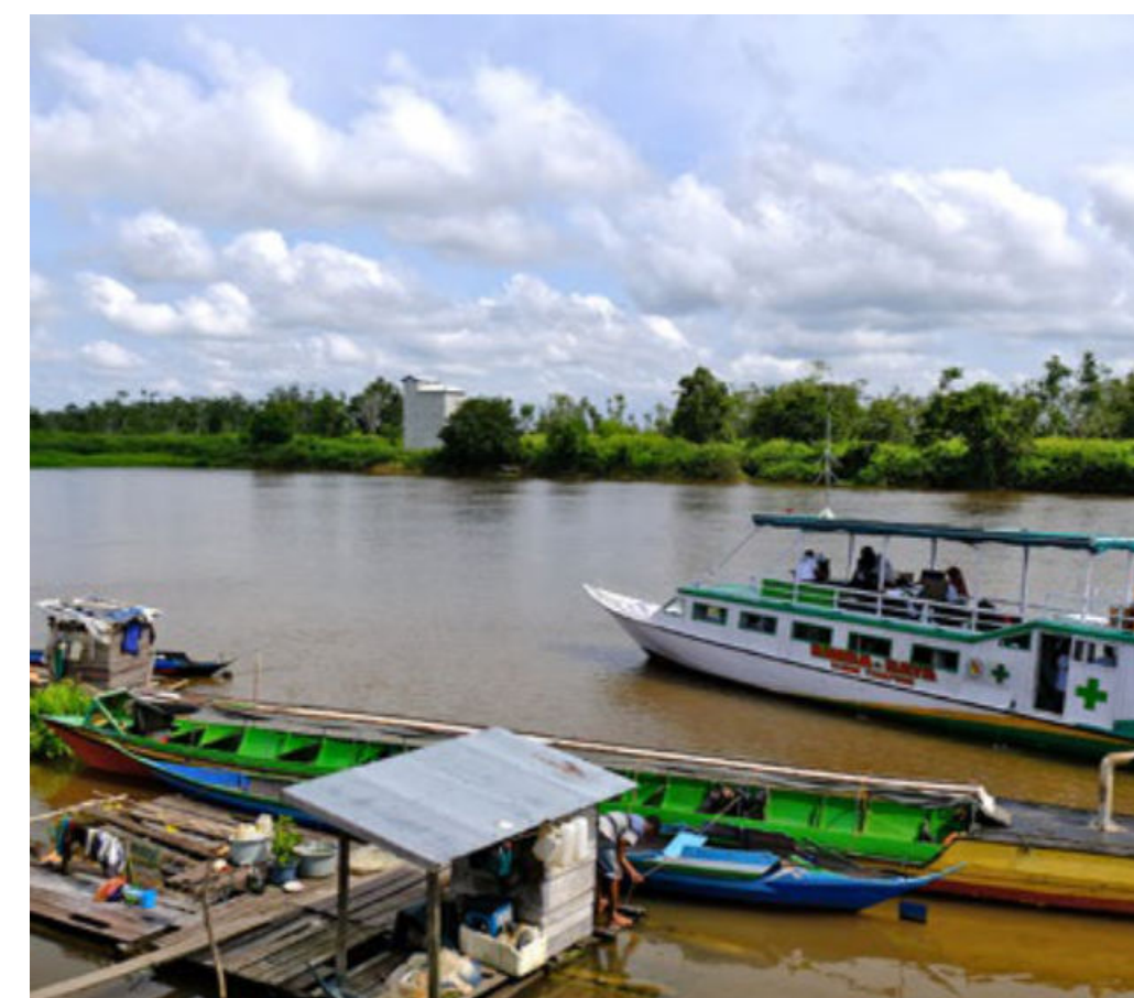
The floating clinic is vital in bringing health services to community members