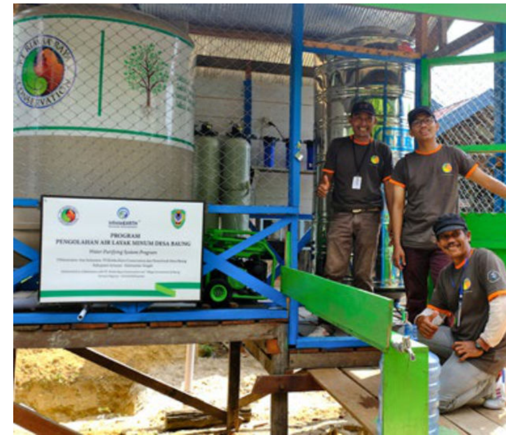
We have built three water purifying systems in the project area