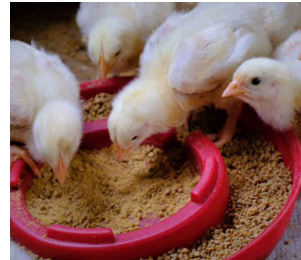
Micro-enterprises help community members improve their economic status