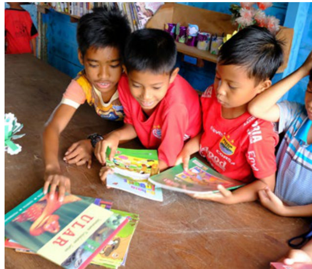
Libraries help us increase literacy levels