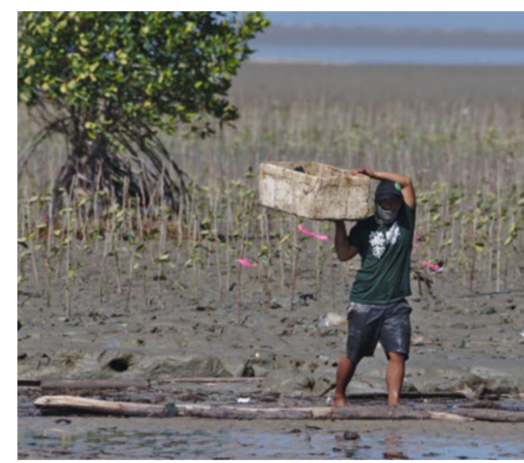
Mangrove and tree planting is essential in rehabilitating the area