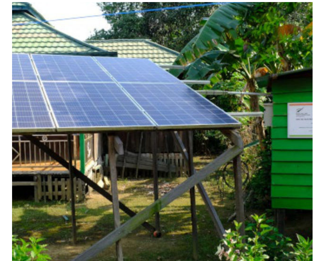
Solar power has been installed in community centres and public roads