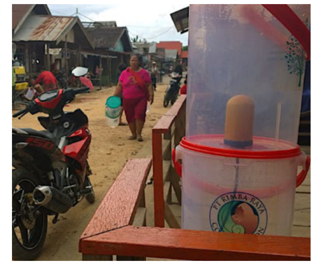
Water filters are vital in an area where access to clean water is limited